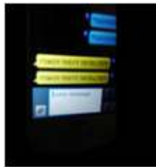
Fig 2: Output on Mobile

Power theft is occurring it can detect the exact location. We can stop the power theft.